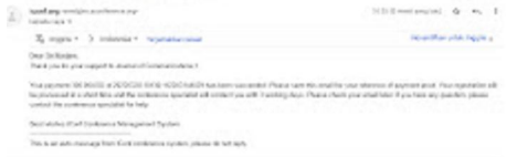
Payment Evident1.jpeg 74K