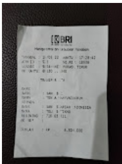
Payment 1570764342.jpeg 75K

Sobat BRI! Dana Rp 4.300.000,00 keluar dari rekening 3013***4533 pada 18/05/22 17:28:42. Ket.: 601301025781134 0#0000000 18536 #ATM #TRFLA