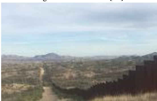
Figure 3 Border Wall [14]

The regulation or the policy issued by the US government actually contradicts the human rights in which people are created equal and the pursuit of happiness. As a result, a family who becomes immigrant cannot live together because of the regulation.