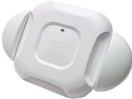
Figure 1. Cisco USC 8718 Installed in Cisco Aironet 3700